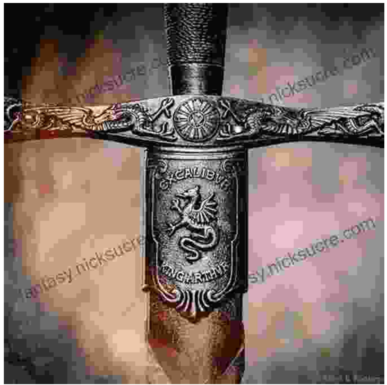
The Hallowed Origins: Stonehenge and the Lady of the Lake

finest metals and imbued with magical properties, Caliburn possessed a razor-sharp edge and an unbreakable spirit.